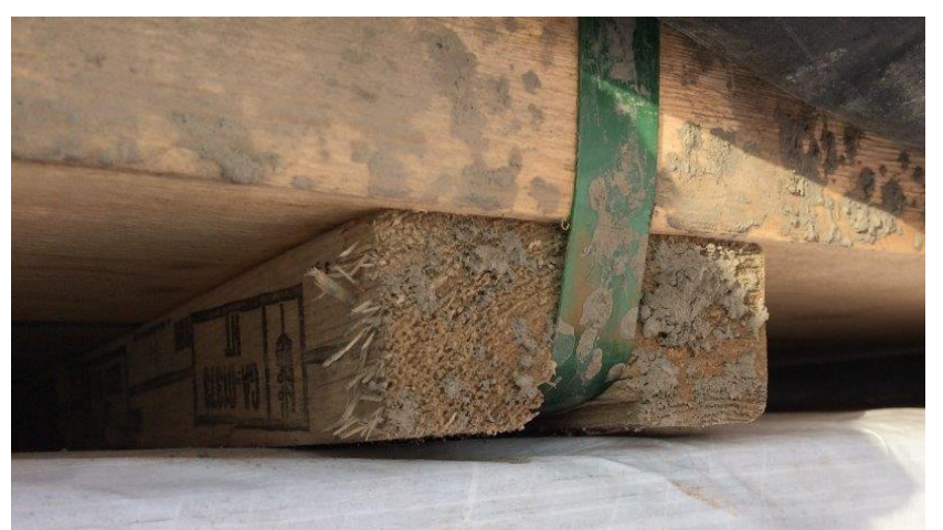
A thick layer of soil which can be scraped and gathered is not acceptable.